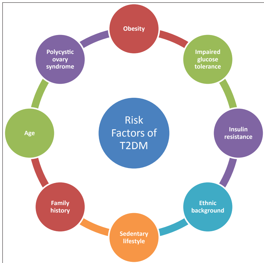
Figure 2: Some of the main risk factors of type 2 diabetes mellitus

GDM is defined as any degree of glucose intolerance or diabetes diagnosed at the outset or during pregnancy, usually the second or third trimester. This definition earlier also included any undetected T2DM which may begin prior to or occur at the time of pregnancy onset. However, the latest recommendations of the International Association