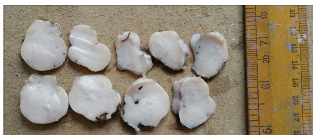
Figure 2: Gross examination: the mass is firm, nodular, gray white with the few yellowish areas

It tends to involve the CNS very rarely and in a slightly older age group. [2] Isolated intracranial involvement is very rare, and there are <150 cases described. [3] This involvement is most commonly in the form of dural-based masses mimicking meningiomas. These lesions may present in the suprasellar region, convexity, parasagittal region, cavernous sinus, petroclival region, and cerebellum. Two cases with locally aggressive features and dural sinus involvement have been reported by Toh et al. [4] Pachymeningitis [5]