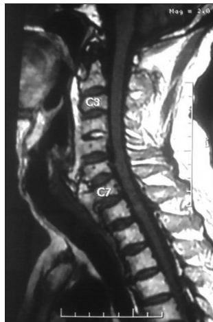
Figure 3: Diffuse idiopathic skeletal hyperostosis – magnetic resonance imaging

obviously irregular due to osteophytes. The large protruding bulge was obstructing the view of subglottic region; almost half of the tracheal lumen was obstructed. We estimated that the tracheal lumen would accommodate endotracheal