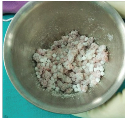
Figure 1: A half of vancomycin powder mixed with autogenous bone graft