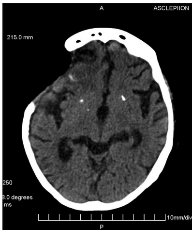
Figure 3: Postcontrast computed tomography scan 3 weeks after surgical procedure reveals the intracranial infections decreased

best of our knowledge is the first case that Achromobacter xylosoxidans implicated for an intracranial abscess formation in an adult patient who had not undergone any prior neurosurgical procedure.