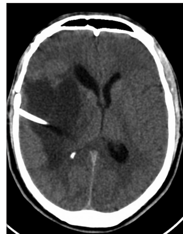
Figure 4: Axial CT Brain showing Interval insertion of the right-sided ventriculoperitoneal shunt with mild interval improvement in the hydrocephalus and midline shift Stable amount of surrounding vasogenic edema with decrease in the size of cystic