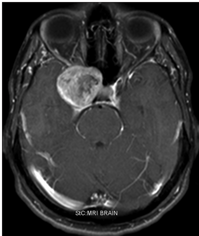
Figure 1: Axial magnetic resonance imaging brain with contrast before the first surgery, showing extra-axial heterogenous mass (meningioma) is seen in the right para-sellar region