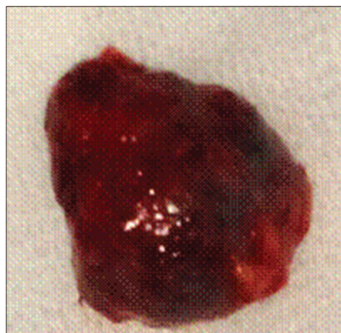
Figure 2: The specimen of the orbital tumor after resection