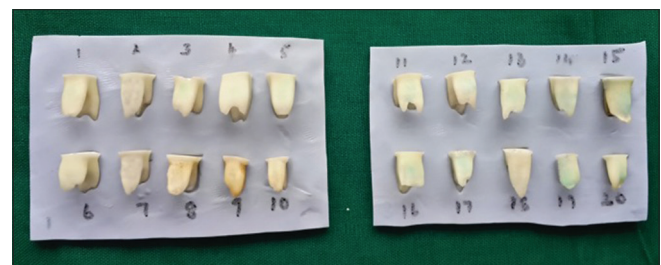
Figure 1: Arrangement of samples in vinyl polysiloxane impression material template for spiral computerized tomography scanning

The samples of Group 1-5 were mounted in vinyl polysiloxane impression material template (Express™ XT Putty Quick, 3M ESPE Germany) and were arranged by placing the mesial surface on the right side so as to maintain uniformity in all samples [Figure 1]. The samples were then subjected to light speed plus SCT scanner (GE Electricals, Wilwaukee, USA) in axial, coronal, and sagittal plane by an experienced operator. Volume rendering and multiple planar volume reconstruction for root canal