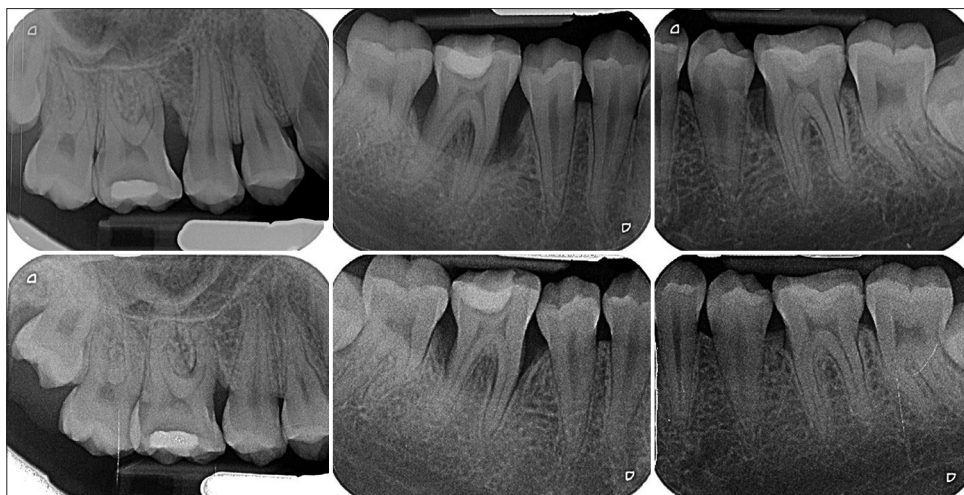
Figure 2: Periapical radiographs comparing baseline condition (upper line) with the situation 1 year after nonsurgical and pharmacological therapy (lower line)