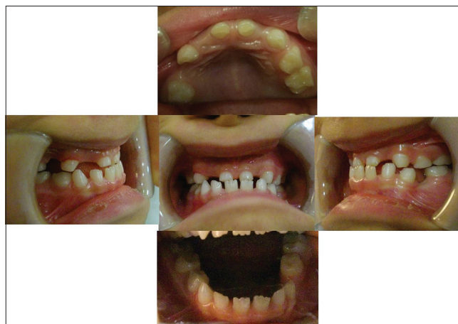
Figure 2: A full serial of intraoral photography at recall visit. Healthy gingiva condition and anterior crossbite with four primary teeth congenitally missing