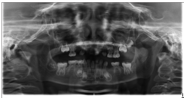
Figure 4: Panoramic X-ray showed multiple permanent tooth germs (#12, #14, #15, #17, #22, #25, #34, #35, #37, #45) and four primary teeth (#52, #54, #62, #74) congenitally missing