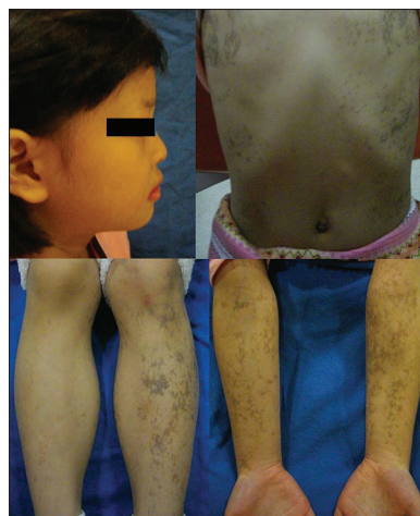
Figure 1: Patient presented a straight lateral profile. Whirling-like pigmented lesions over trunk and four extremities

This girl had symmetrical facial appearance with straight facial profile [Figure 1]. On intraoral photography, this girl demonstrated that bimaxillary incisors were in the relationship of crossbite with acceptable oral hygiene with healthy gingiva condition [Figure 2]. Bilateral lower primary incisors were shedding, and proximal caries were noted between upper left primary molars. A primary dentition with generalized spacing and four primary teeth congenitally missing (#52, #54, #62, #74) were demonstrated on periapical and bitewing X-rays [Figure 3]. Multiple permanent tooth germs (#12, #14, #15, #17, #22,