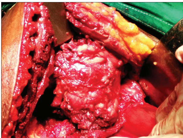
Figure 3: Complete surgical excision of the sarcoma with surrounding tissue around it