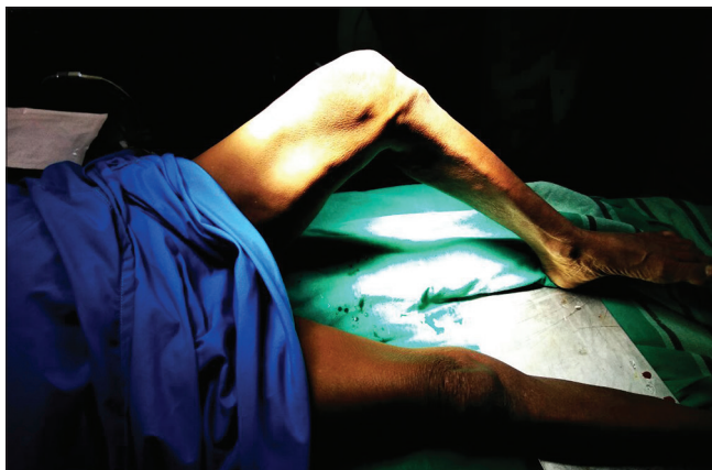
Figure 1: Involuntary flexion of the hip depicting flexion deformity due to the retroperitoneal mass over iliopsoas muscle

RMS should not be diagnosed with a scan and biopsy. An excisional biopsy is a way to go and confirmed by frozen section during the surgery. Furthermore, delayed investigations and imaging can lead to added burden postoperatively. To the best of our knowledge, this is the only reported case of RMS involving the iliopsoas.