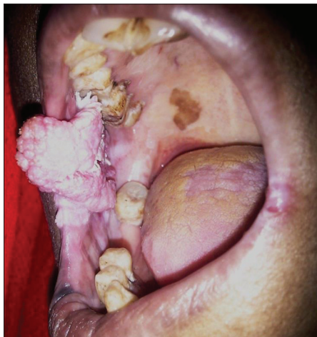
Figure 2: Verrucous lesion buccal mucosa