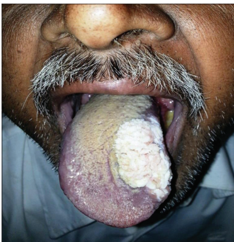
Figure 3: Verrucous lesion tongue

final histopathology report [Table 2]. Of these 10 had well differentiated, 3 had moderately differentiated squamous carcinoma and 1 verrucous carcinoma. The majority of the patients (12/14) were either T1 or T2 lesions. Eleven patients underwent elective neck dissection all of whom were found to be negative for neck node metastasis. The