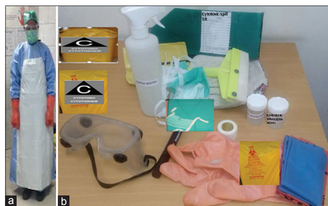
Figure 2: (a) A health-care worker wearing appropriate and adequate personal protective equipment for handling cytotoxic spill. (b) Cytotoxic spill kit: Cytotoxic container, cytotoxic bag, cytotoxic degrading agent, hypochlorite solution, water, personal protective equipment as shown, absorbent, forceps, scissors, tape, marker pen, dust pan, shovels, mops, securing signage, tape, appropriate disposal bag

Each institution should maintain a log book of cytotoxic drugs. Cytotoxic drugs and their waste should be properly identified with the capital “C” symbol and under it, the word “Cytotoxic” in capital letters [Figure 1a]. [11,12]