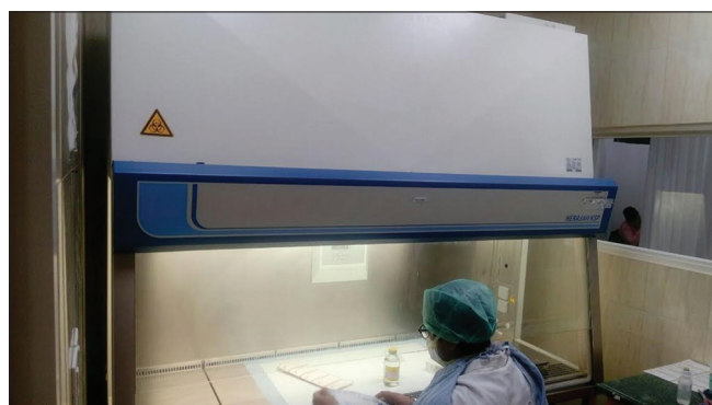
Figure 3: Biosafety hood with high-efficiency particulate air filter

Packaging can have high levels of contamination. The pharmacy should have unpacking area to limit exposure risks. The unpacking area should be a separate dedicated room, separate from eating areas. There should be adequate ventilation in the area, negative pressure, and preferably vented to the outside and it should have a receptacle for the disposal of secondary packing. [17,18] Workers should wear a protective gown and two pairs of gloves when unpacking and cleaning cytotoxic drugs, from the opening