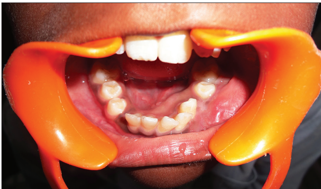
Figure 4: Preoperative photograph showing central giant cell granuloma lesion in relation to teeth numbers #33–42

for cases 3 through 5 [Table 1], cellular connective tissue stroma with numerous multinucleated giant cells, blood capillaries, bony trabeculae with osteocytes in lacunae, and mild lymphocytic infiltrate was seen on hematoxylin and eosin stained sections, suggestive of CGCG [Figure 6].