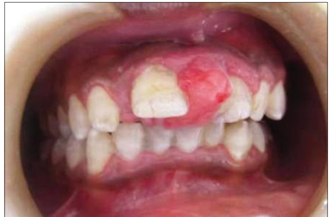
Figure 3: Preoperative photograph showing peripheral giant cell granuloma lesion in relation to teeth number #11 and 21 [37]

A total of 5 GCG were identified in this case series, of which 2 cases were diagnosed as PGCG and 3 cases as CGCG. PGCG lesions occur more than 2 times more