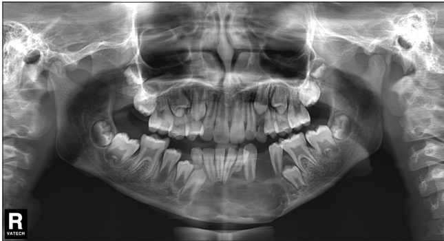
Figure 2: Preoperative orthopantomogram showing radiolucent central giant cell granuloma of the mandible crossing the midline

In all cases, a provisional diagnosis of giant cell granuloma was made on the basis of history and clinical examination. The serum calcium, phosphate, alkaline phosphatase, and parathyroid hormone (PTH) levels were undertaken to eliminate hyperparathyroidism in all cases. The histologic examination for patients 1 and 2 [Table 1] showed a nonencapsulated mass of tissue compiled of a fibrillar connective tissue stroma containing fibroblasts, multinucleated giant cells, blood vessels and hemosiderin pigmentation, suggestive of PGCG [Figure 5]. Histologically,