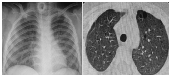
Figure 2: X ray and CT chest post chemotherapy and bilateral povidone iodine pleurodesis showing residual cysts but complete resolution of pneumothorax. (Six weeks from diagnosis)

This case had radiology suggestive of miliary mottling at presentation. Tuberculosis, a common concern in the