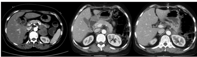
Figure 1: Preoperative and postoperative images of left adrenalectomy

A 60-year-old female presented with a 2 years' history of left abdominal pain radiating to the back. There were no constitutional symptoms, as well as recent weight loss. There was no history of hypertension, diabetes, and tuberculosis, and her HIV antibody was negative. Physical examination showed mild abdominal discomfort on palpation. Computed tomography was performed, which revealed a well-circumscribed heterogeneous mass measuring 7.6 cm × 7.7 cm × 6.8 cm located in the left suprarenal area, abutting distal pancreas, and kidney [Figure 1]. Neither venous thrombosis nor metastatic lesions were noted. Twenty-four hours urine collections for cortisol and catecholamines were normal, as were serum aldosterone and adrenocorticotropic hormone levels.