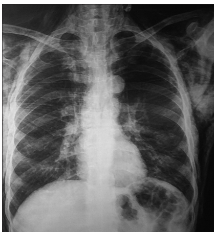
Figure 1: A chest X-ray (posteroanterior view) showing subcutaneous emphysema in the neck

the pneumomediastinum and subcutaneous emphysema, and the patient was symptomatically better. After withdrawing the ICD, he was discharged from hospital. One week later, he died suddenly at home after an attack of coughing.