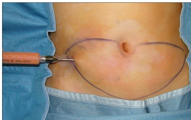
Figure 1: The fat harvesting site

The procedure was always performed under general anaesthesia. The fat was harvested from the abdomen or, in thin patients, from the thigh and from the gluteal area, after local infiltration with a 2% mepivacaine with epinephrine solution. A 2-mm skin incision was performed with an 11 blade and the anaesthetic solution was infiltrated using a multiple-hole infiltration cannula. A 3-mm, 3-hole blunt cannula connected to a 10 mL Luer-lock syringe was used to harvest the fat [Figure 1]. The harvested fat was always centrifuged at 3000 bpm for 3 min. The skin incision was sutured with a 5/0 nylon suture. An elastic dressing was placed in the donor area. The fat was transferred to a 2 mL Luer-lock syringe