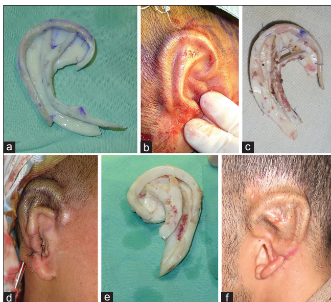
Figure 3: Photographic examples of the framework (left image in each pair) and contour after the insertion (right image in each pair). The actual surgery was performed in developing nations after training simulations using plastic eraser models. Patients shown are a 9-year-old male (a and b), a 20-year-old female (c and d) and an 18-year-old male (e and f)

stainless wires and 5-0 polydioxanone sutures to form a framework while the assistant surgeon closed the donor-site incision. When details were carved into the framework using carving gouges, overcontouring was attempted as the postoperative form is not as conspicuous as the underlying framework. After inserting the framework into the skin pocket, a suction drain was placed, and the contour was packed with paraffin gauze dressing. Total surgical time from initial incision into the lobule until application of a loose, overlying dressing of fluffed cotton was 3 h and 30 min.