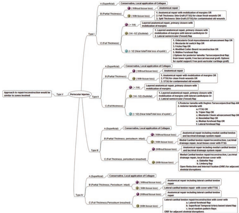
Figure 8: Algorithm for approach to periocular injuries

description of the eyelid injuries among the clinical team members and in planning a treatment strategy. For example, when referring a patient to a specialised centre, a trauma physician can inform the reconstructive surgeon that they are referring a patient with Right Type II C 2 injury which translates into a full thickness lower eyelid injury on the right side with the loss of nearly half of the lower eyelid. In addition to providing a compact description of the injury, this would also help the reconstructive surgeon to plan their treatment and resources appropriately. There are, however, situations, where the traumatised periocular tissues get devitalised over a period following trauma. Hence, the initial injury classification made at presentation may need to be revised, as we have described in clinical scenario 3.