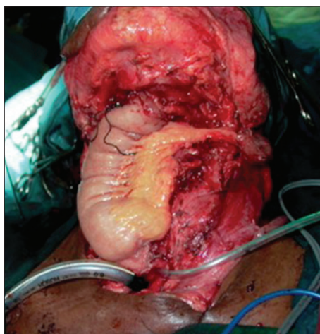
Figure 1: Pharyngeal reconstruction performed with jejunal-free flap

Post-operative PCF was seen in 20 patients (37%), of which 15 of these patients were managed conservatively and 5 required surgical intervention in the form of a second flap reconstruction (PMMC flap in three and radial forearm-free flap in two).