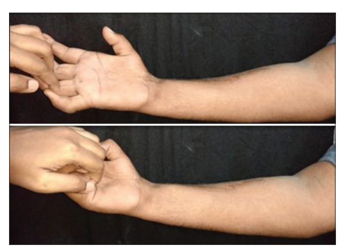
Figure 7: Measuring strength of finger flexion

was M4 in 5 patients and M3 in three patients [Figure 7 and Videos 1,2].