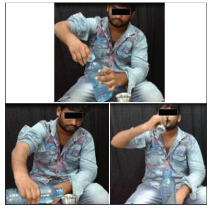
Figure 12: Functionality of reconstructed hand