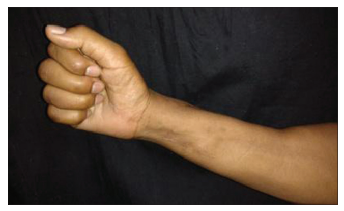
Figure 6: Pulp to palm distance 0 cm

Four of the eight patients got a functionally useful hand to carry out activities of daily living with hook grip, span grasp, key pinch, chuck grip and pulp pinch. These