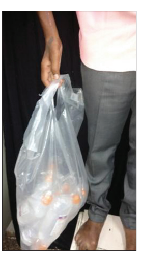
Figure 8: Measuring hook grip strength