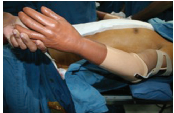
Figure 4: Donor limb after applying prosthesis