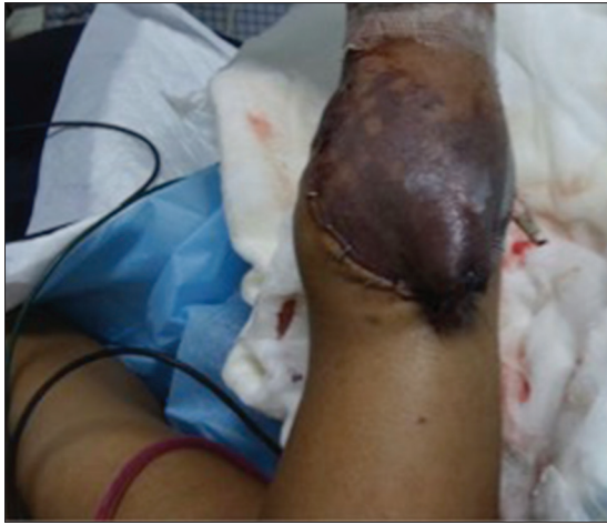
Figure 11: Congestion of the ulnar skin flap of left hand - 48 h post-operative