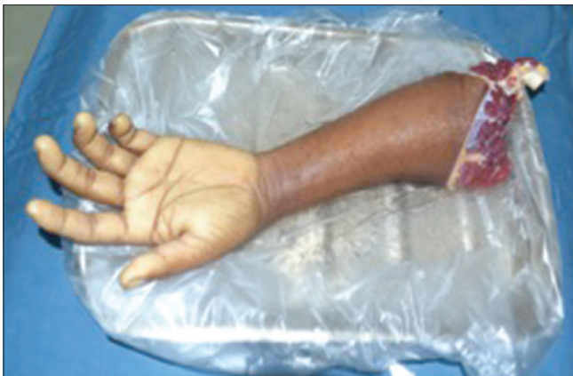
Figure 5: Donor forearm kept in ice slush