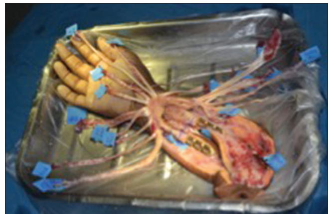
Figure 6: Donor limb ready for transplantation

muscle mass and the severity of reperfusion injury. Aggressive periosteal stripping was avoided, and the bones were plated with 3.5 mm locking compression plates [Figure 6]. In our first donor, there was an open dislocation of proximal interphalangeal joint of the middle finger of the right hand which was reduced, and the laceration was sutured.