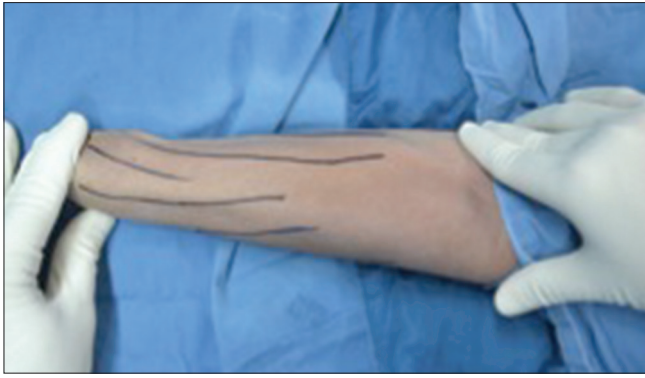
Figure 7: Marking of superficial veins