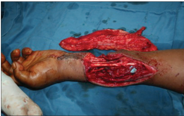
Figure 12: Defect after immediate debridement of the devitalised tissues and harvested anterolateral thigh flap