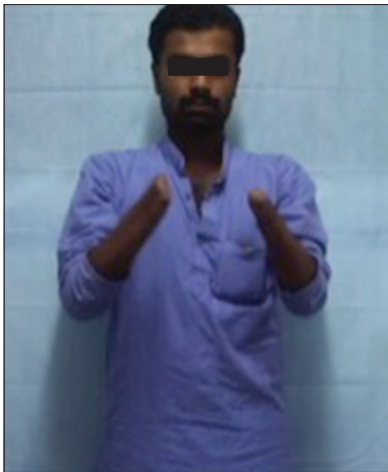
Figure 1: Pre-operative photograph of our bilateral first hand transplant patient