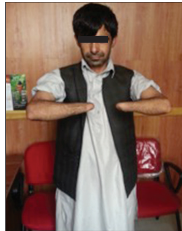
Figure 2: Second bilateral hand transplant patient before the procedure