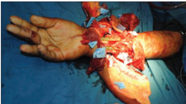
Figure 9: Bone fixation with 3.5 mm locking compression plate

hand. Hence, the ulnar artery had to be anastomosed immediately, which re-established the vascularity of the limb. In our second case, on the left hand, the ulnar artery was anastomosed first to avoid a similar situation.