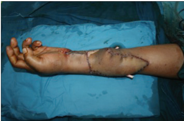
Figure 13: After resurfacing the defect with anterolateral thigh flap

in India considering the prevalence of CMV which is 80%–90%, and the scarcity of donors for hand transplant, it will be difficult task to get a negative donor if the recipient is also negative for CMV. Both of our patients were treated with prophylactic antiviral therapy with Ganciclovir.