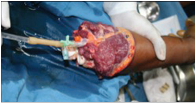
Figure 3: Cannulated disarticulated forearm after infusion of University of Wisconsin solution