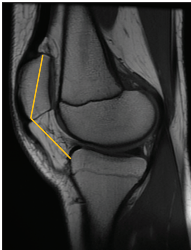
Figure 1: Insall–Salvati indices: from patellar bone length and patellar tendon length, the latter of which was defined as the distance between the proximal point of the tibial tuberosity and the inferior pole of patella

Patella alta evaluations were performed on 40 adolescent patients by three orthopedic specialists (Group I) and three radiology specialists (Group II), each with a minimum of 5 years of professional experience, who all worked at our hospital. The Insall–Salvati (IS), modified Insall–Salvati (MIS), Caton–Deschamps (CD), and Blackburne–Peel (BP) indices were used for the evaluations on MRI obtained for the purpose of patellar instability diagnosis. The IS indices were calculated from patellar bone length and patellar tendon length, the latter being defined as the distance between the proximal point of the tibial tuberosity and the inferior pole of the patella [Figure 1]. The CD indices were calculated from the patellar articular cartilage length and the distance between the lowest point of the part of the patella in contact with the femur to the top of the tibial plateau [Figure 2]. The BP indices were calculated from the patellar articular cartilage length and the distance between the tibial plateau line and the inferior pole of the patellar articular cartilage [Figure 3], and the MIS indices were calculated from the patellar articular cartilage length and the distance between the the proximal point of