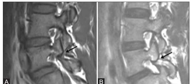
Figure 2 (A and B): T1 sag and T2 sag showing pars defect of L5

IFA produces compensatory biomechanical changes in the pelvis and spine. Increased anterior acetabular coverage, anterior pelvic tilt, and hyperlordosis are some of the biomechanical changes typically associated with IFA leading to hip-spine syndrome and early hip osteoarthritis. [2] Hyperlordosis of the lumbar spine—resulting in increased stress over posterior arch structures, ligaments, and facet