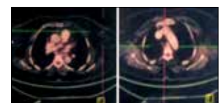
Figure 2: Positron emission tomography-computed tomography image post six cycles of paclitaxel and carboplatin chemotherapy showing near-complete metabolic resolution at left breast and complete metabolic resolution at right paratracheal lymph node

smooth muscle actin (SMA), and CD10. C-Kit was weakly expressed. The tumor was negative for estrogen receptor (ER), partial response (PR), and Her2/neu expression. Final report was myoepithelial carcinoma of breast, intermediate grade. Three-week postsurgery, she had noticed a new lump in her breast adjacent to previous incision. Positron emission tomography-computed tomography (PET-CT) scan [Figure 1] showed multiple ill-defined nodular masses in left breast parenchyma, largest nodule measured 2.1 cm × 2 cm. A 1.6 cm × 1.5 cm heterogeneously enhancing fluorodeoxyglucose (FDG) avid right paratracheal node was seen. Also noted was complete collapse of D1 vertebral body with FDG avid lytic areas in bilateral pedicles and left transverse process.