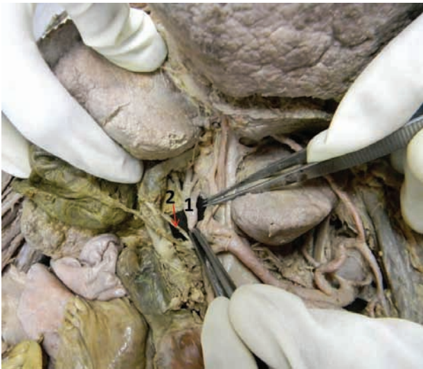
Figure 4. 1= Branches from right terminal hepatic artery entering through Porta hepatis 2= Cystic branch from the right terminal hepatic artery.