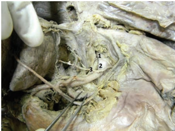
Figure 1. 1= Abdominal aorta , 2= Coeliac trunk, 3= Right inferior phrenic artery, 4= First aberrant hepatic artery taking origin from the right inferior phrenic artery.