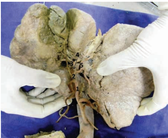
Figure 3. 1= Common hepatic artery, 2= Hepatic artery proper, 3= Right terminal branch of hepatic artery, 4= Left terminal branch of hepatic artery, 5= Accessory hepatic artery

arteries. The splenic artery had a normal origin, course and branching.