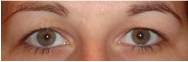
Figure 1. Image showing the anisocoric pupil in the patient. Note that left pupil is larger when compared to the right pupil, in the same light conditions.