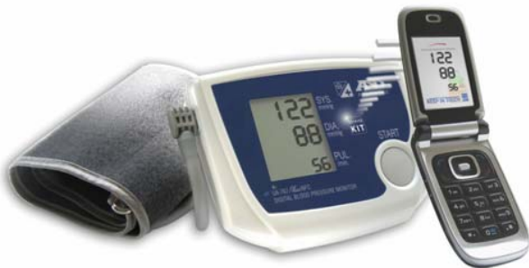
Figure 1 Blood pressure meter UA-767 Plus NFC (AND, Japan) with integrated NFC module (AIT Austrian Institute of Technology, Austria) to allow for wireless transmission of measurement values based on the ISO 14443 standard.