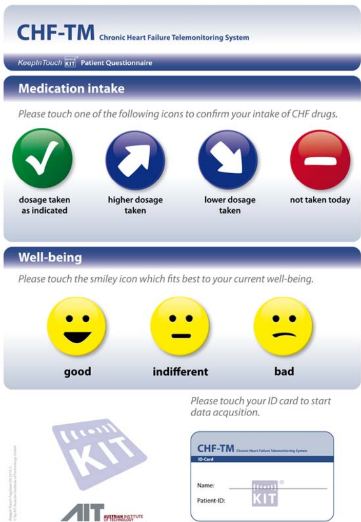
Figure 2 Icon table of the symbol based patient questionnaire concept with inlaid RFID-tags to indicate about medication intake and well-being condition.