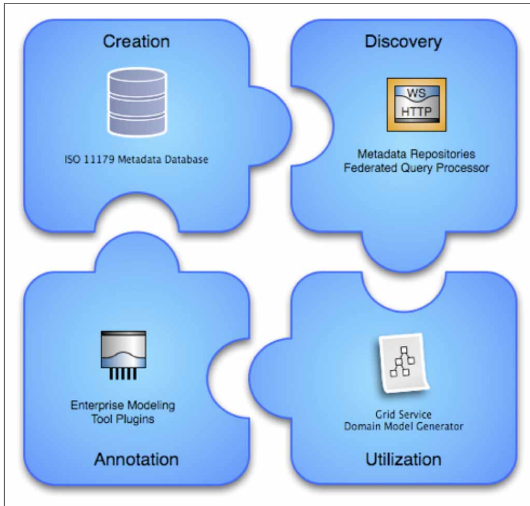
Figure 3 Overview of openMDR components, including an ISO 11179 compliant metadata database, enterprise modeling tools and annotation plug-ins, grid-service domain model generator, and federated metadata query processor.