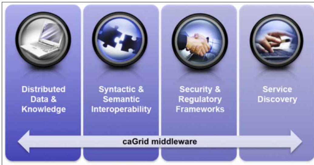
Figure 1 Overview of four caGrid design and key design and functional aspects that correspond to data and knowledge sharing requirements present in the contemporary clinical and translational research environment.