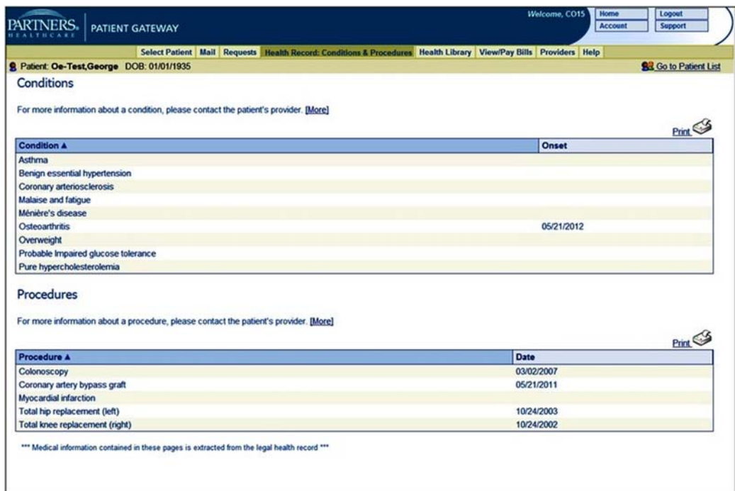
Fig. 1 Screenshot of the Personal Health Record Condition and Procedure List