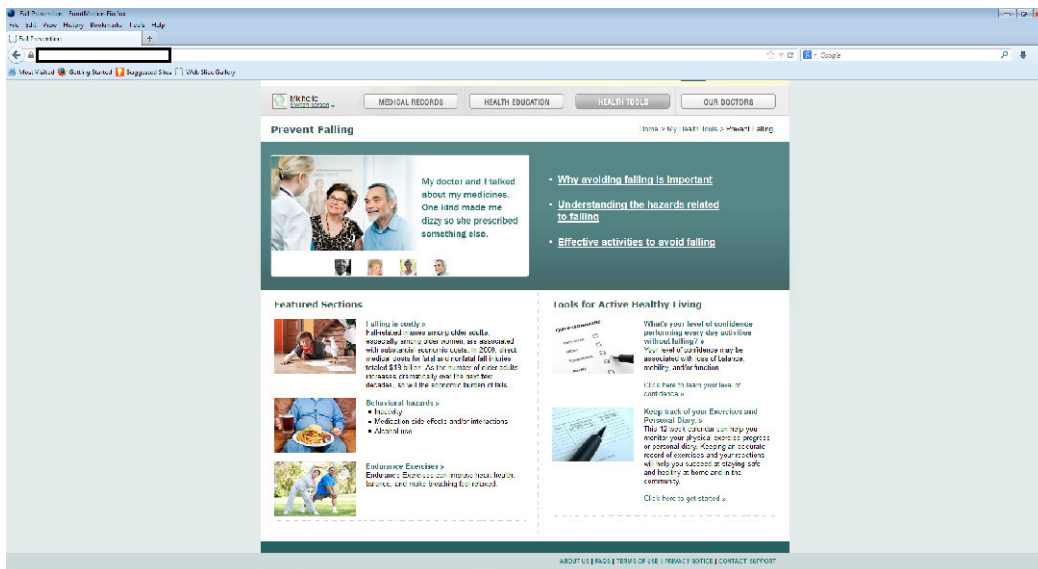
Fig. 1 Self-assessment via a Personal Health Record (SAPHeR) Homepage