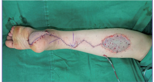
Fig. 4. Long term follow-up

The flap is transposed to the defect area by carefully rotating the flap over its pedicle up to 180°. Then the recipient site is closed, and the donor site is either primarily closed or skin grafted.