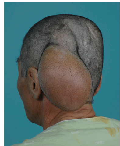
Fig. 1. Preoperative photograph. The mass on left occipitoparietal area was grossly measured to be about 20 cm × 15 cm × 10 cm.

A 58-year-old male patient was referred to our institution with a huge mass of the left posterior scalp. The patient first recognized the mass on the posterior scalp area about 30 years previously. The mass had been growing slowly ever since, but during the most