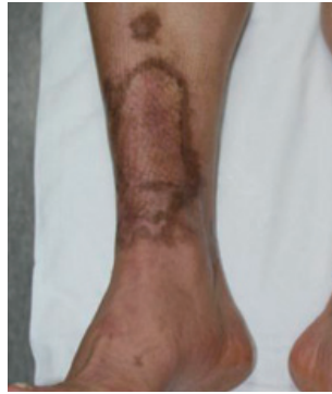
Fig. 4. Photograph of the lesion 5 months after the operation. Healing had completed in the right right pretibial area.

Copyright © 2013 The Korean Society of Plastic and Reconstructive Surgeons This is an Open Access article distributed under the terms of the Creative Commons Attribution Non-Commercial License ( http://creativecommons.org/licenses/by-nc/3.0/ ) which permits unrestricted non-commercial use, distribution, and reproduction in any medium, provided the original work is properly cited.