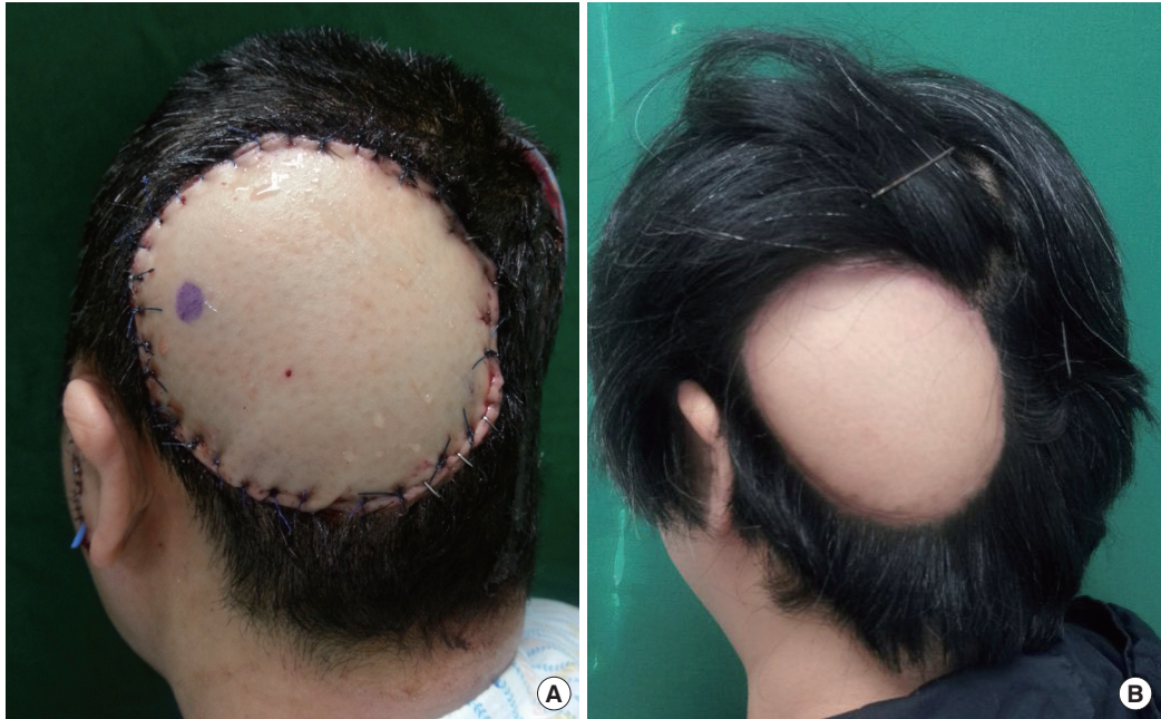
Fig. 4. Postoperative findings. (A) Photograph at 3 days after the operation. (B) Follow-up photograph at 8 months after the reconstruction. The photograph shows an aesthetically pleasing contour and no recurrence.

may even extend intracranially, causing a high degree of morbidity and possible mortality. Local recurrence after excision is frequently seen [2]. Therefore, the authors decided to perform a wide full-thickness excision of the tumor, which subsequently required free flap coverage. Options for scalp reconstruction include the use of local flaps, tissue expansion, or free flaps [3]. It is generally accepted that the best replacement for scalp tissue is adjacent tissue because there is no other donor site on the body that can match the hair-bearing qualities of the scalp. Therefore, local flaps are the optimal choice for the best cosmetic effect. However, in the event of extensive scalp defects, where local tissue rearrangements are inadequate for reconstruction, the use of local flaps is limited [3].