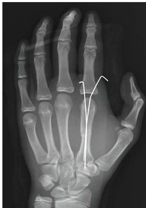
Fig. 1. A 15-year-old male had an oblique fracture on the shaft of the right second metacarpal. A plain radiograph taken 4 weeks after surgery shows the two K-wires placed after reduction of the right index metacarpal.

Since its introduction in 1909 by Martin Kirschner, K-wire fixation with sterilized, sharpened, smooth stainless steel pins has been the most available and forgiving technique for the fixation of most fractures and dislocations in the hand and wrist. K-wires have been widely used in bone operations due to their simplicity, reliability, and cost-effectiveness. According