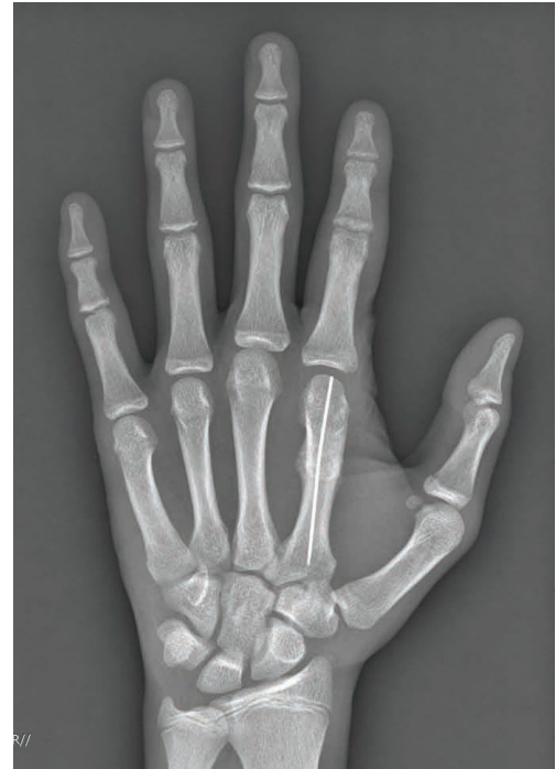
Fig. 3. Plain radiograph obtained at 6 weeks postoperatively, showing the residual K-wire portion in the medullary cavity.

A 15-year-old male was admitted to our hospital with right hand swelling and pain. Plain radiography revealed an oblique fracture in his right index metacarpal shaft with a dorsal apex angulation of 25 degrees. Under axillary block anesthesia, a tourniquet was applied to the upper arm at 250 mm Hg, and under fluoroscopic guidance, the fractured index metacarpal was reduced using the Jahss maneuver. The metacarpophalangeal (MP) joint and the proximal interphalangeal (PIP) joint were flexed at 90 degrees and upward pressure was applied on the flexed finger to correct dorsal apex angulation. After reduction, two 1.1 mm thick K-wires were inserted from the sides of the second MP joint to the metacarpal base. The locations K-wires were checked using a fluoroscope, and the distal sharp ends were cut to leave a 1 cm length of wire (Fig. 1). To immobilize the fractured segment, a short arm splint was applied. A week later, the short arm splint was removed and active range of motion