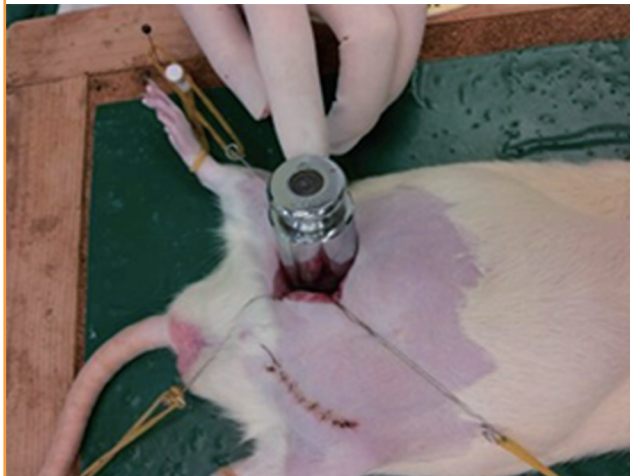
Table 1. Time needed for hemostasis

A puncture was made to the femoral artery and covered with a 1.5 cm × 1.5 cm piece of dressing material according to each group. A 200-g pendulum was then placed on top of the dressing material to apply pressure and removed after a 30-second interval to check whether the bleeding had stopped.