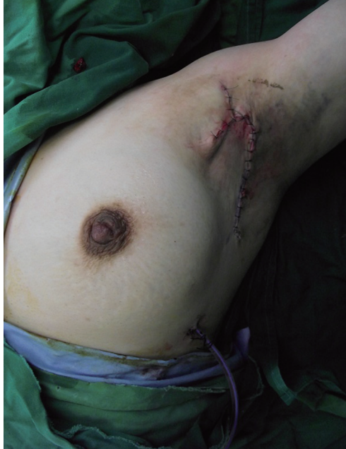
Fig. 4. Release procedure and rotation flap are performed and drainage tube is placed at inframammary fold.