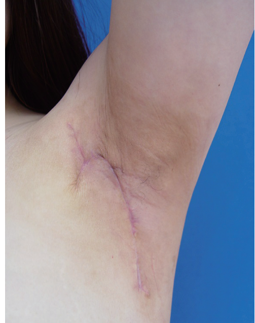
Fig. 5. After 6 months of operation, range of motion of axilla is improved and there is no complication.

periprosthetic infection to severe infection with pus and systemic symptoms like fever [1], and as presented case, it may lead secondary complications. Important determinants of infection are mainly related with underlying conditions of patient and surgical techniques.