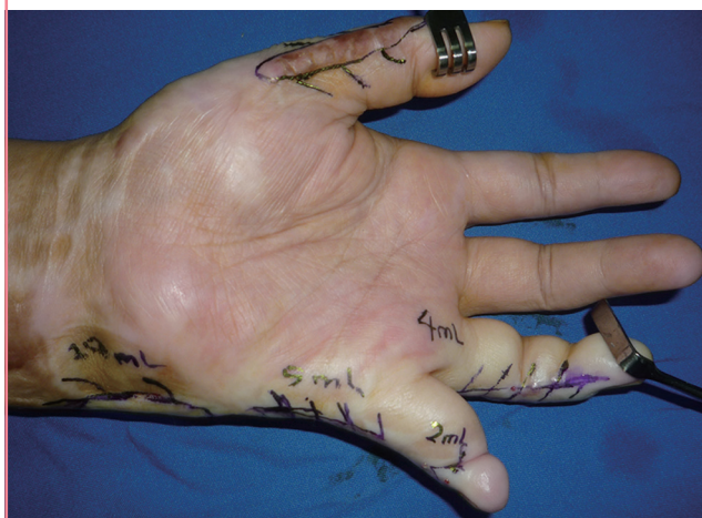
Fig. 2. A totally bloodless operative field

Operative field 19 in patient 5 consisted of three operative fields on the right hand. The three operative fields were located adjacent to one another, resulting in the confluence of injections. Thus, the three operative fields were ultimately characterized as a single operative field with regard to the assessment of operative field clarity.