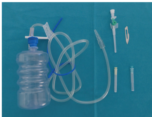
Fig. 1. Equipment for seroma drainage system: a 20 G hypodermic needle (alternatively a 21 G hypodermic needle or a needle cannula), high-vacuum Redon drainage, and a blade.

After pricking the skin and identifying the seroma, it is possible to open the drainage. The liquid will be drained from the drainage system without the use of different syringes. If a change of the drain site is