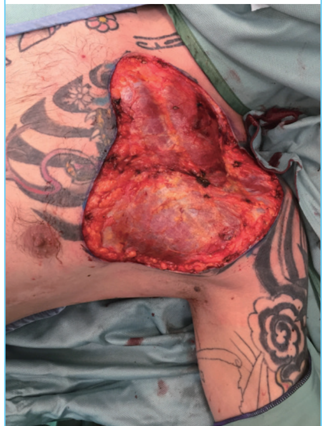
photo allergic effect, a chronic inflammatory reaction or trauma stimulating a malignant transformation. The previously reported melanomas arising in tattoos differ in their methods and materials used so it is difficult to ascertain a link between them. Several patients had radiotherapy to the area so that may have

The defect left post excision and prior to skin grafting.