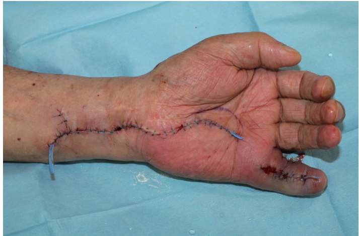
Fig. 4. Postoperative view.