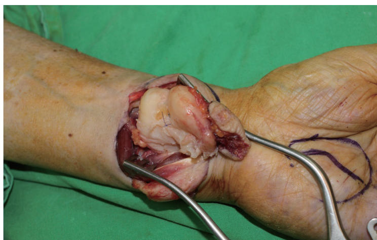
Fig. 2. Encapsulated shiny corpuscles filled with rice bodies were found surrounding the common flexor tendon sheath.