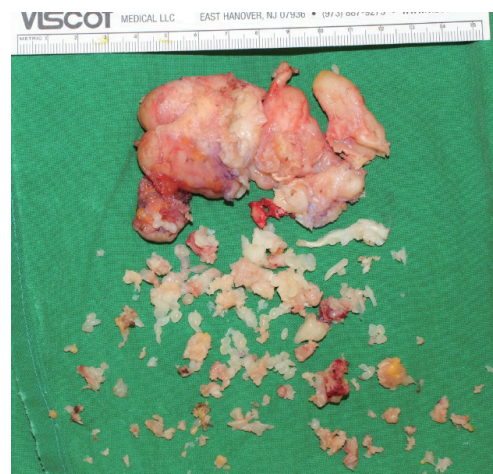
Fig. 3. Removed masses with multiple rice bodies: a wrist mass measuring 9 cm × 7 cm, a palm lesion measuring 2 cm × 5 cm, and a finger corpuscle measuring 1 cm × 5 cm and containing scattered rice bodies were removed.