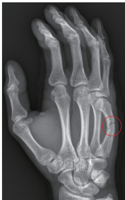
Fig. 1. Preoperative X-ray of the first fracture event. The X-ray shows the fracture of the fifth metacarpal bone shaft of the left hand (red circle).

A 30-year-old male visited Bucheon St. Mary's hospital with a swelling on his left hand after a slip-and-fall injury. He was diagnosed with a left fifth metacarpal bone fracture by hand computed tomography (CT) and X-rays (Fig. 1). The first operation was performed 8 days after the injury, and open reduction was performed. To stabilize the fracture segments, a bioabsorbable plate and screws (Linvatec Biomaterials Ltd., Tampere, Finland) were used for internal fixation. Although the 1-year follow-up was uneventful, the patient visited us with swelling on the previous operation site. Physical exam showed just the swelling of the soft tissue of the operation site without any fluctuation, heat, or erythema. We recommended further evaluation such as an imaging study, but the patient refused to undergo it. Therefore, we decided to observe the patient without administering any medication because there was no evidence of infection. Four months later, the patient visited us again because of another trauma at the same site. Physical examination, CT, and X-rays were conducted, and the patient was diagnosed with a refracture of the fifth metacarpal bone with increased soft tissue swelling as compared to when we first noticed it 4 months previously (Figs. 2, 3). We