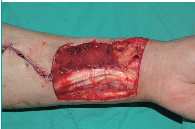
Fig. 2. Intraoperative tie-over dressing

The locations of the flexor carpi radialis and brachioradialis were approximated. The adjacent skin flap was advanced toward the defect, and the margin was quilted at the wound bed to fully define the space and encourage a minimal wound size. If the lateral antebrachial cutaneous nerve was exposed, the radial side of the skin flap was advanced over the lateral antebrachial cutaneous nerve for protection. Vicryl 4-0 sutures were used.