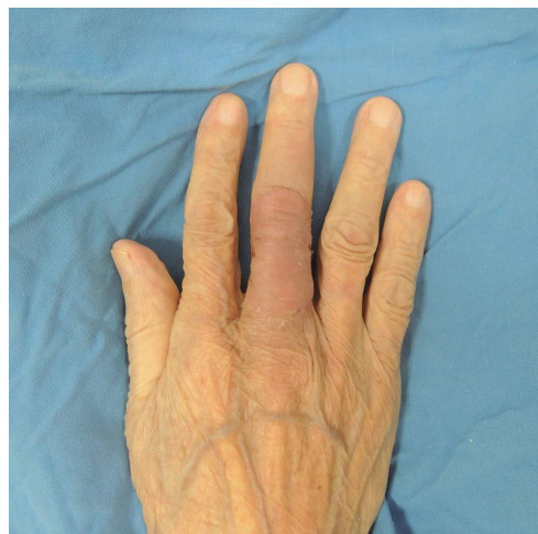
Fig. 5. Postoperative photograph at a two-month follow-up visit.