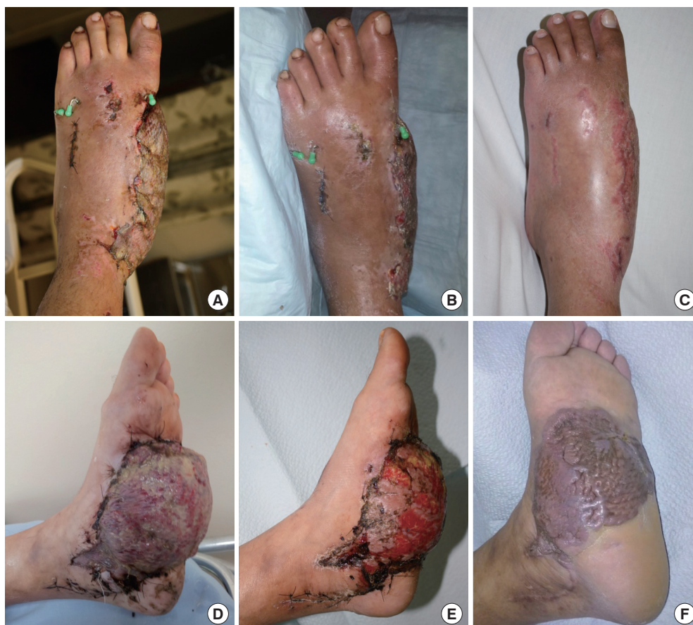
Fig. 3. Comparison between flaps with VAC and open dressings

Comparison between flaps with VAC and open dressings in the foot treated with immediate postoperative VAC dressing (Group 1; A–C) and wet to dry dressings (Group 2; D–F). Free latissimus dorsi flap to left foot (Group 1) at postoperative day 7 (A), 21 (B) and 4 months (C). Flap is not bulky after VAC dressing is taken down and has achieved its final thickness at 4 months postoperative. Free serratus anterior flap to left foot (Group 2) at postoperative day 14 (D), 1 month (E) and 8 months (F). Flap remains bulky in the immediate postoperative period and does not atrophy until 8 months postoperatively. VAC, vacuum assisted closure dressing.