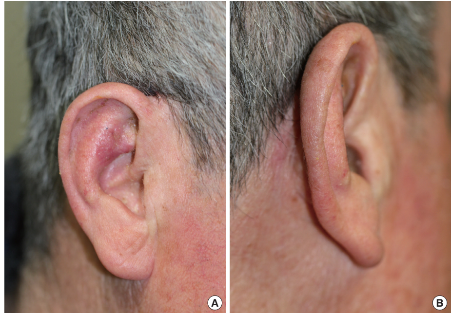
Fig. 4. Five-month postoperative follow-up views. (A, B) Anterior and posterior aspects of the ear.

Our technique can be summarized as follows. First, we approached the postauricular donor site proximally to the sulcus in the medial direction rather than in same region as the defect. Thus, we were able to obtain a sufficient amount of postauricular skin, even in patients with defects of the outer edge of the ear, such as the antihelix or scapha.