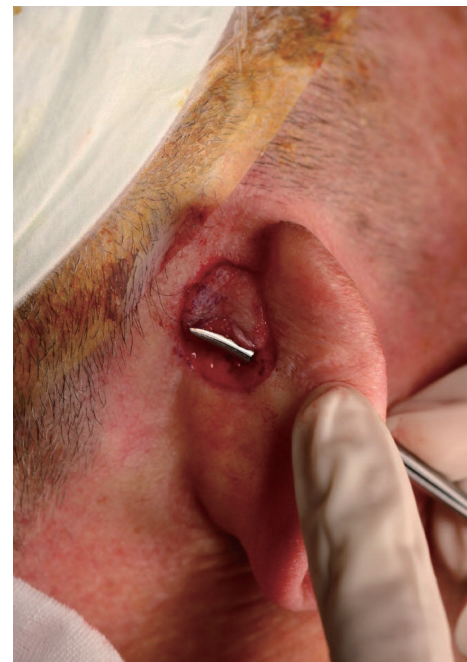
Fig. 2. After creating a skin island, we removed a small, slender piece of cartilage to provide an entrance for the skin flap.