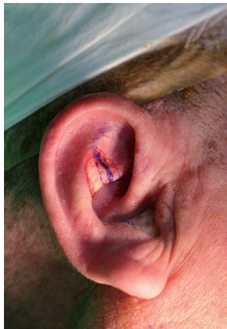
Fig. 1. The defect, located throughout the antihelix and triangular fossa, was oval in shape and 2.0 \times 1.8 cm in size, with exposed cartilage. We decided to create a 30% overlap in the medial direction.

Under local anesthesia, we performed preoperative marking for the skin island, based on the size of the