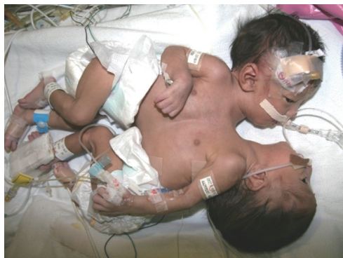
Fig. 1. A 13-day-old thoraco-omphalopagus conjoined twins who shared the heart and the liver.

Conjoined twinning is one of the most uncommon congenital anomalies. Spencer has reported that while the incidence of conjoined twinning is close to