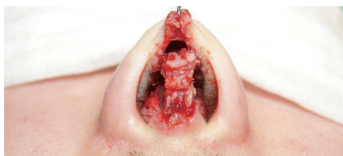
Fig. 2. Intraoperative view. The silicone implant was removed. The only graft and columellar strut graft are shown.