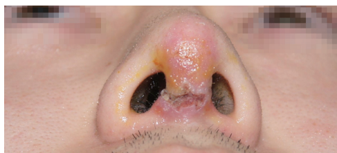
Fig. 1. Preoperative view. Erythema on the nasal tip and columella is shown. The incision wound was disrupted.

For infection control, 400 mg of ciprofloxacin was administered twice a day and massive irrigation was performed. However, fever occurred and symptoms related to sepsis appeared on the third day (Table 1). Therefore, 1,500 mg of amoxicillin was prescribed as a broad-spectrum antibiotic pending the results of the susceptibility test. Five days after the