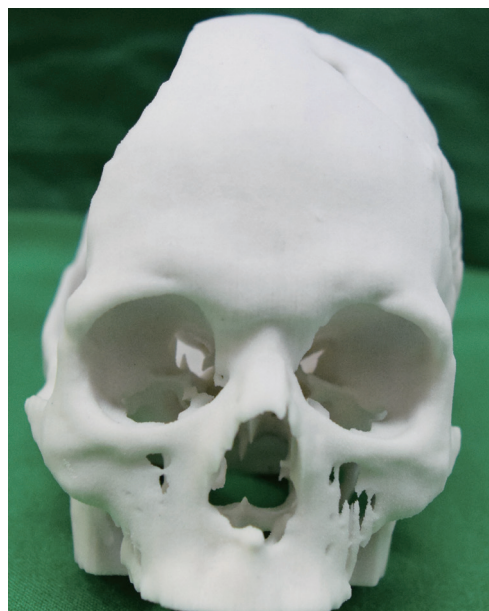
Fig. 2. Three-dimensional (3D) printing model of the patient was made using a 3D computed tomography scan.